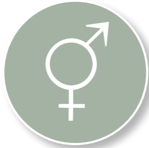
Sex, gender and gender identity pg 6