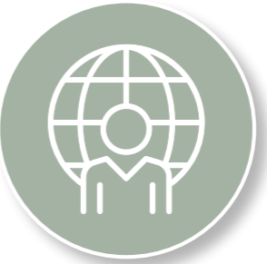
Race, ethnicity and nationality pg 12