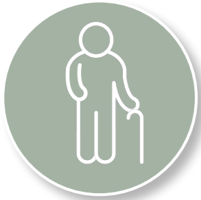
Age pg 4