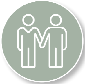
Sexual orientation pg 9