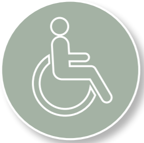
Disability pg 5