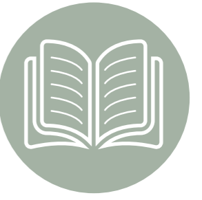
Religion or belief pg 13